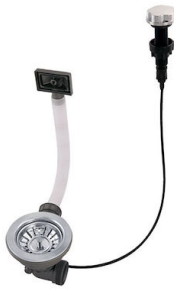
Automatic waste fitting 8407 000