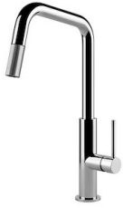
Mixer Tap KS Plus 8522 000